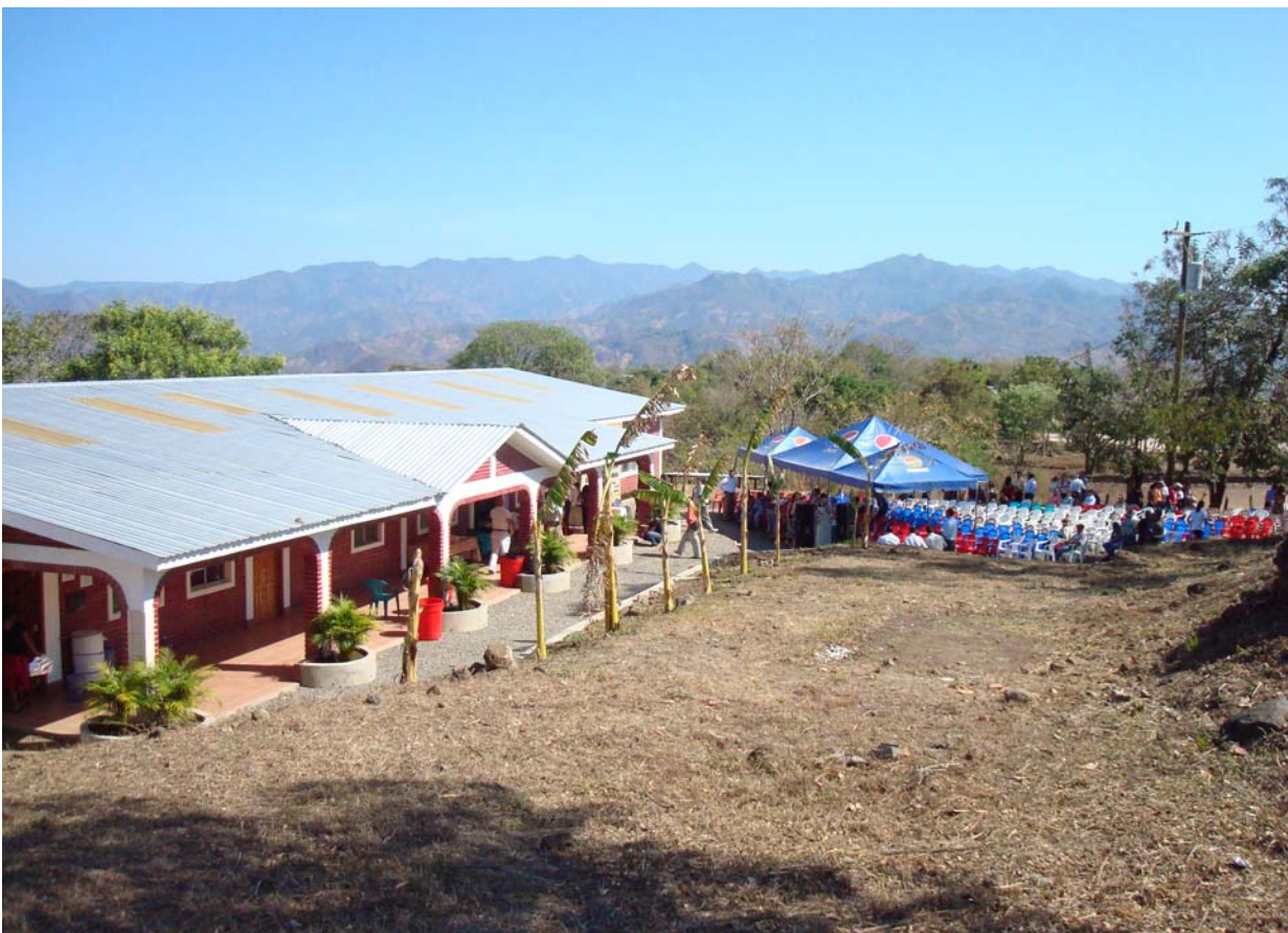
Shoulder to Shoulder Honduran clinic in Concep- cion