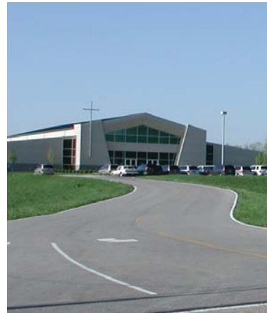
Church-Struble Road entrance